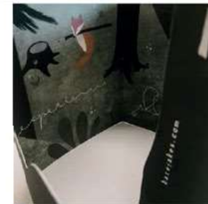
↑ Sustainable Art: ← Self Promotion ↳ Final Major Project